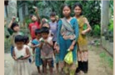
Mymensingh District Services and kid's ministry in Mymensingh.