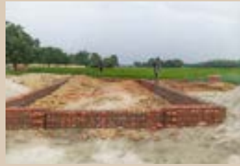
Rajshahi District New church being built.