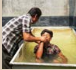
Nilphamari District 19 filled with the Holy Spirit & 33 baptized.