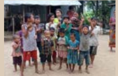
Mymensingh District *4 baptized in the name of Jesus Christ. *Sunday School in a village church.