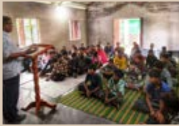
Thakurgaon District 2 new churches planted.