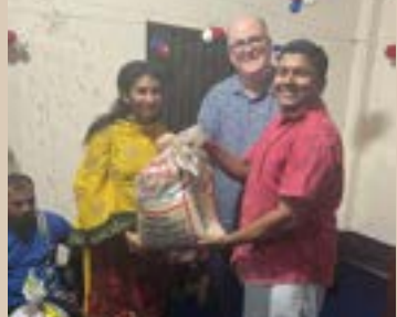
Dhaka District Food donated to members in the Sreepur church.