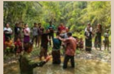
Chittagong Hill Tract District 19 filled with the Holy Spirit & 4 baptized during the Chittagong District Conference.