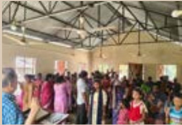
Dinajpur District New church planted & revival services held. 11 filled with the Holy Spirit & 25 baptized.