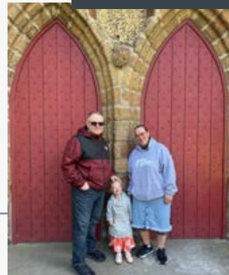
St. Machar's Cathedral