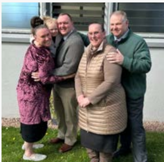
Beautiful Day with the Elgin Church

Please pray with us as we continue reaching out—that these connections would deepen and that there would be a growing hunger for God's Word and a willingness to commit to Bible study. We truly believe that in this season of open doors, there is a harvest ahead, and we are expectant for all that God is going to do.