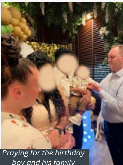
Praying for the birthday boy and his family