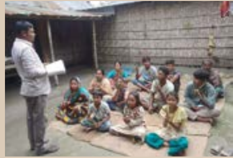
Nilphamari District Palm Sunday service in one of the village home churches.