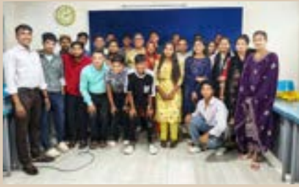
Rajshahi District Seminar on the plan of salvation for a new group of believers.