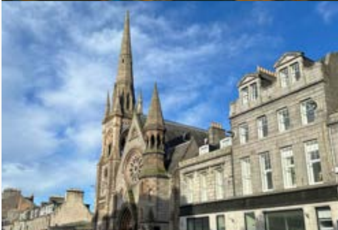
Pictured Above: Castle Street, Aberdeen