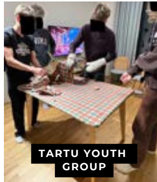
TARTU YOUTH GROUP