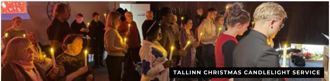
TALLINN CHRISTMAS CANDLELIGHT SERVICE