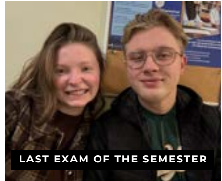
LAST EXAM OF THE SEMESTER