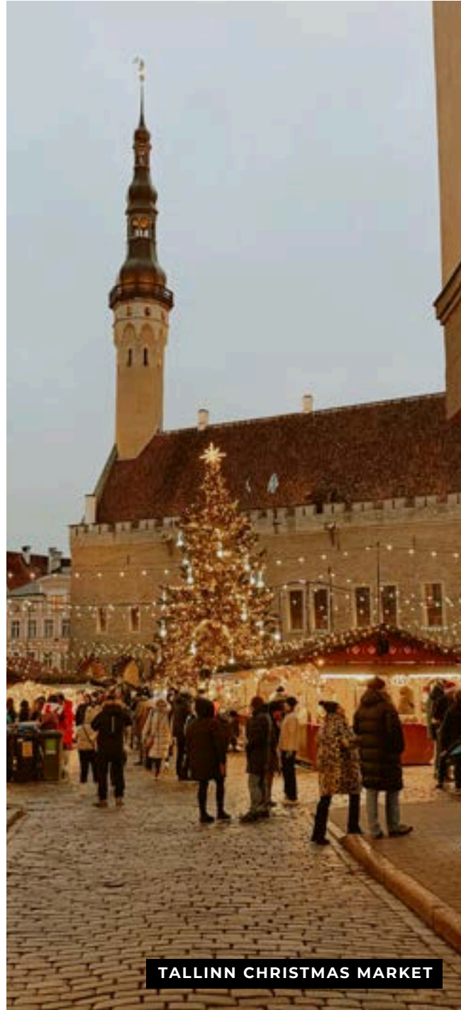
TALLINN CHRISTMAS MARKET

Thank you for taking the time to read our final newsletter of 2025. We hope each of you had a Merry Christmas! And have a Happy New Year!