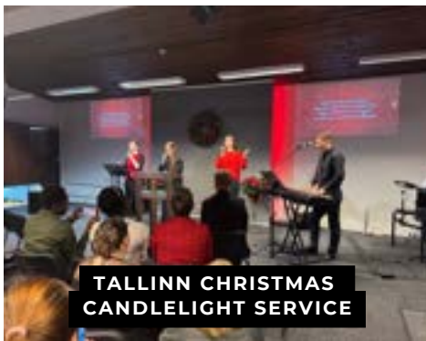
TALLINN CHRISTMAS CANDLELIGHT SERVICE