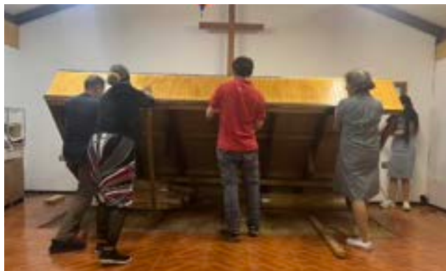
Lifting the platform

platform to both side walls, which will greatly improve its functionality. We also added air conditioning and will be hanging our electronic screen from the ceiling. It will be great for posting song lyrics as well as other media that seems appropriate.