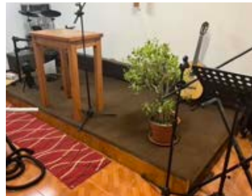
This was the original cofiguration