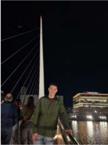
PUENTE DE LA MUJER