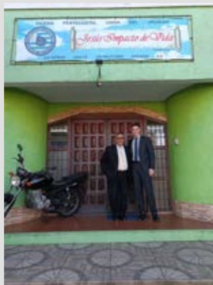
WITH PASTOR OF TACUAREMBÓ OUTSIDE THE CHURCH