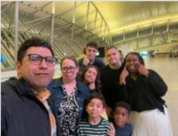
GOODBYE WILBERS :(