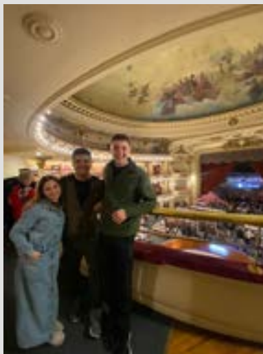
INSIDE THE BOOKSTORE