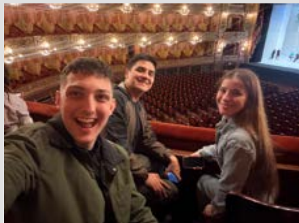
INSIDE THE HUGE THEATRE AT TEATRO COLÓN