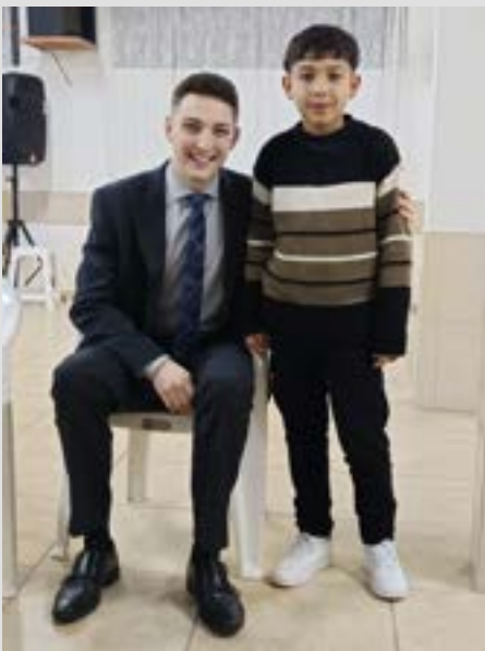
DRUMMER FOR SERVICE IN TACUAREMBÓ!