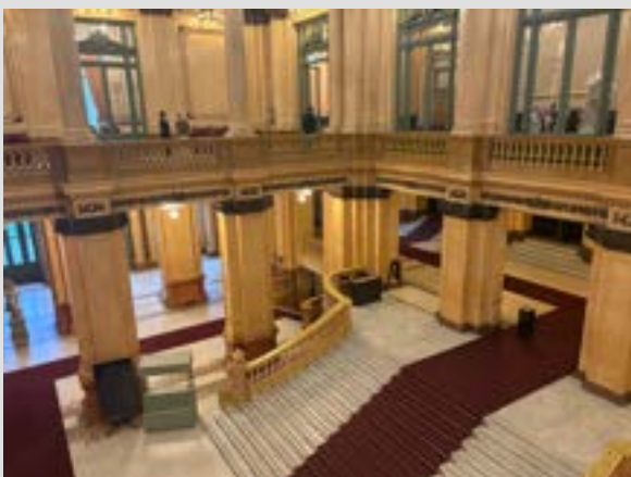
TOUR OF TEATRO COLÓN