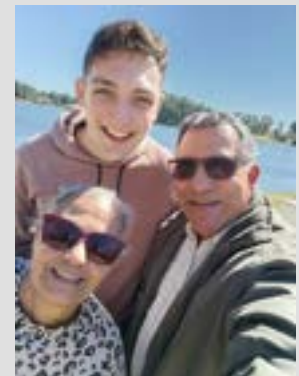
PASTOR AND WIFE IN TACUAREMBÓ