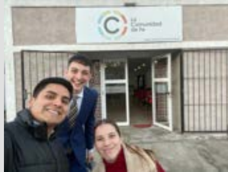
SUNDAY IN SAN JOSE