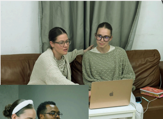
the church and ladies bible study

Next, I want to talk about the blessing of Monday night Ladies Bible Study . This is a group of ladies from all different churches in the area on a Zoom call. I had the opportunity of speaking one night and I was able to speak on our beautiful purpose. Love God, know God, love others. I was able to talk to the ladies and answer any questions for them that they had about me and my time here in Brazil. I think they blessed me more than I blessed them with the encouraging words and the prayers they sent for me. I left the Zoom call with a refreshed and uplifted spirit remembering each word and really just remembering the beauty of the God I am able to serve. There is truly something so amazing about a group of ladies, young and old, gathering together to hear the word of God and to uplift each other. This is something I will always pray over and ladies I will always remember.