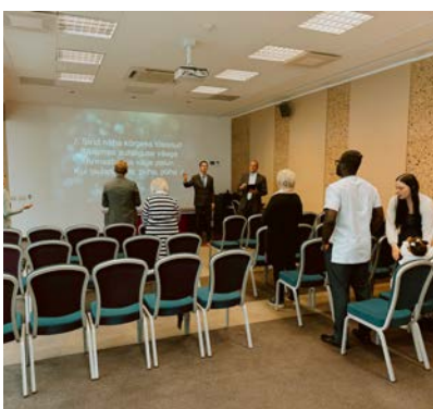
Tartu Church Service