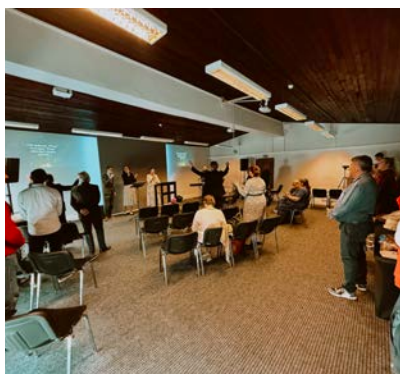
Pentecost Sunday Church Service