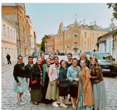
Women at AMTF