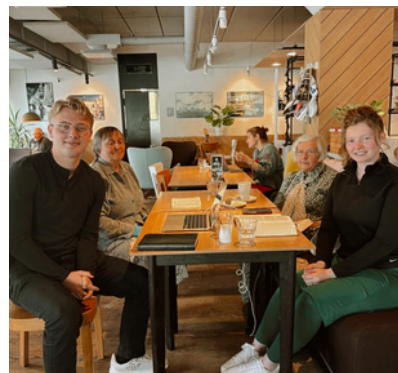
Tartu Midweek Bible Study