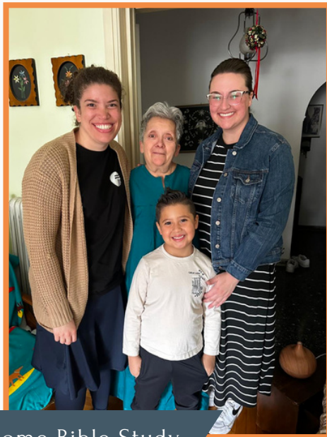
Home Bible Study