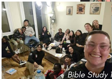
Bible Study 1