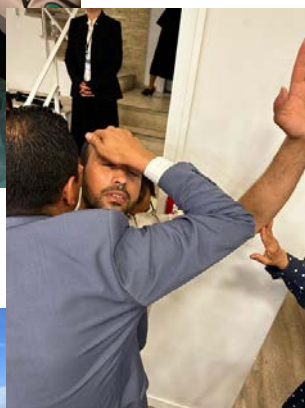
Receiving the Holy Ghost