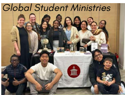
Global Student Ministries