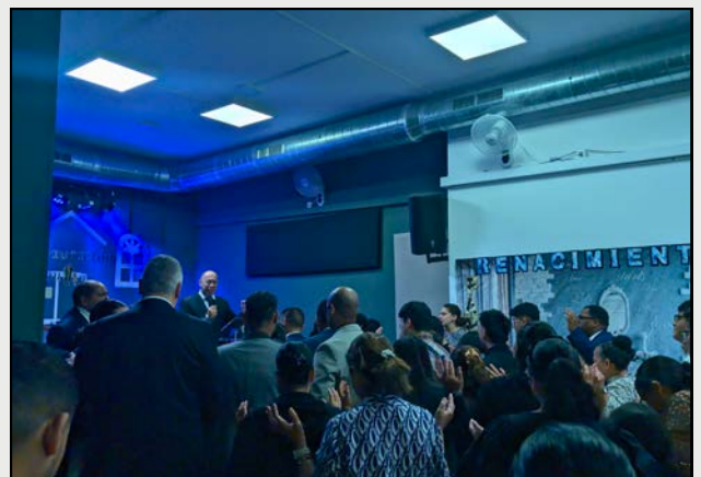
UPCI President of Spain preaching at LPBCN

IF YOU ARE INTERESTED IN OFFERING YOUR SUPPORT THROUGH DONATIONS, YOU CAN PARTNER BY MAKING A ONE-TIME CONTRIBUTION OR SETTING UP A MONTHLY DONATION!