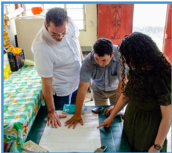
PRAYING OVER BUILDING PLANS.