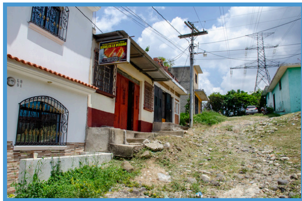
PINULA CHURCH STREET.