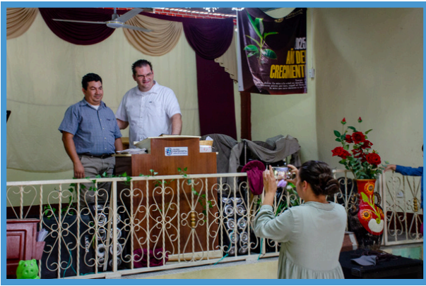
INTERVIEW FOR PINULA CHURCH.