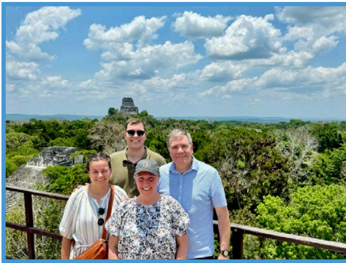
VIEWPOINT OF MAYAN RUINS.

We were thankful for a visit from our parents and coming along with us to see the Mayan ruins.