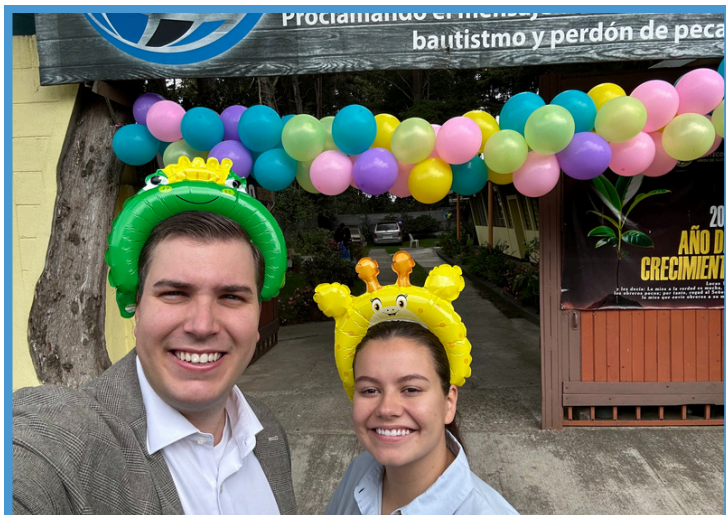
PREPARING FOR SUNDAY SCHOOL SERVICE.