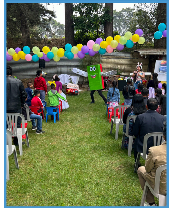
SUNDAY SCHOOL SERVICE.

We had a powerful service led by the Sunday school team followed by an amazing altar call.