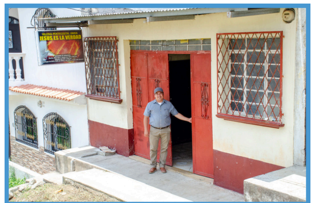
PASTOR OF PINULA CHURCH.