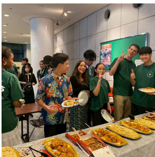
Youth fellowship after Southern Region Conference youth service. Most of us were still wearing the youth shirts.

And, we bought our flights for NAYC! They were cheaper than we had seen in weeks, so thank you for all your prayers and donations!