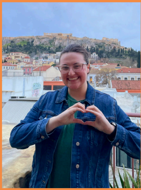
Greece Independence Day Celebration in Salamina