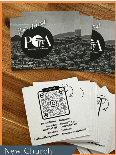
New Church Cards