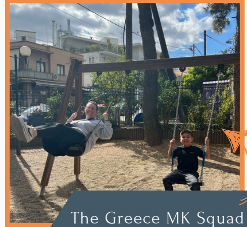
The Greece MK Squad