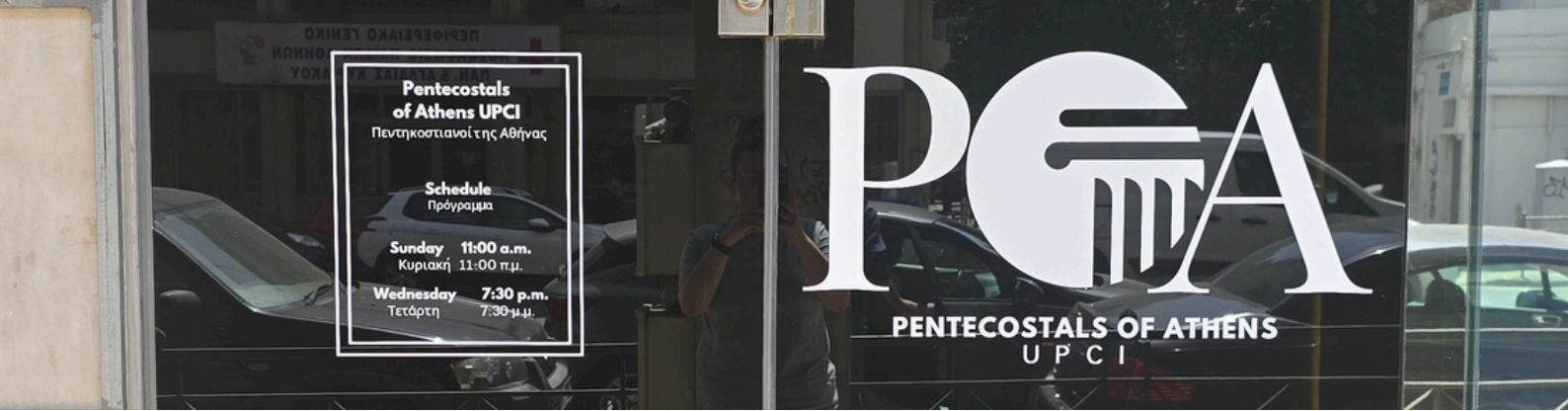
Making Friends Through Hard Labor :)