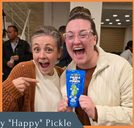
My "Happy" Pickle