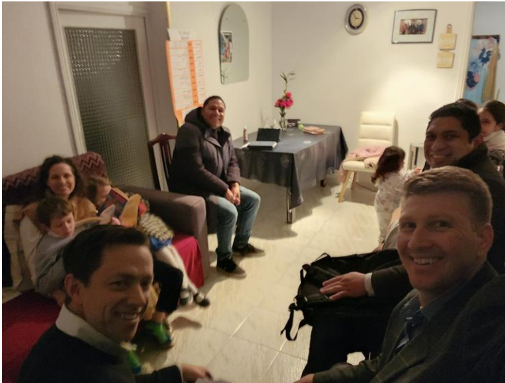
Our first small group meeting in Alcala de Henares.

First time guest praying and seeking God!! God ministered to her deeply this night!