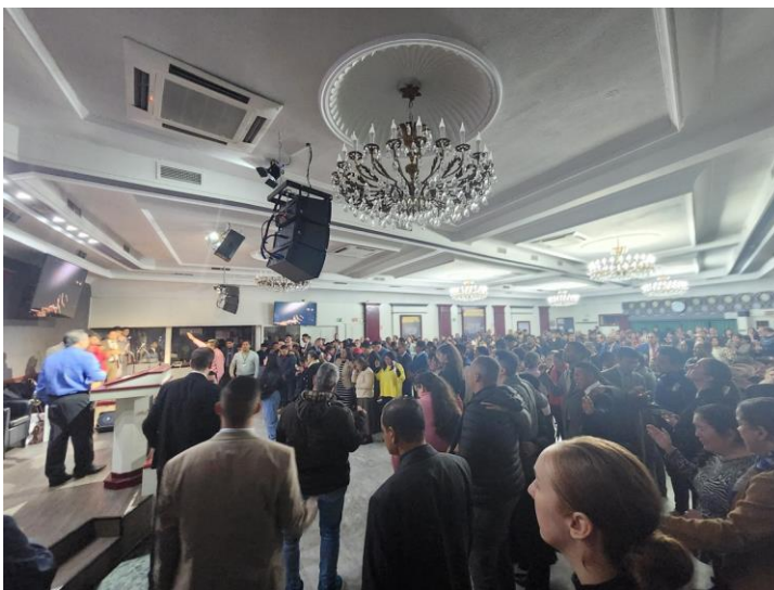
Our first service at Tabernaculo De Vida Madrid. Their genuine worship, and zeal for God is BEAUTIFUL!