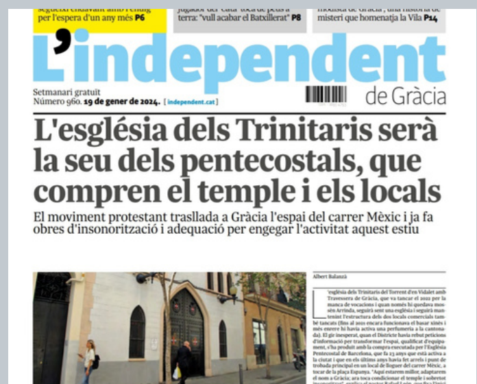
The purchase of the catholic church was big news for the neighborhood.