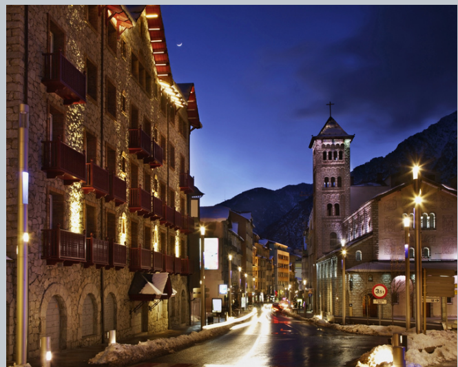
Andorra la Vella- Andorra