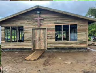
Apostolic Oneness UPCI of Sawani